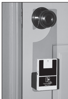
Hang on door inside room