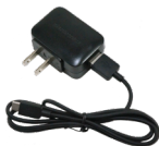
power adapter and cord

Your new Clarity AH200 amplified headphones are ready to provide high quality sound. Setup is easy and should take just a couple of minutes.